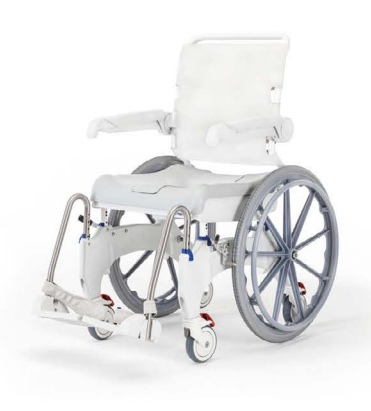
Ocean 24" Ergo

An entry level attendant propelled model with a heavier maximum user weight