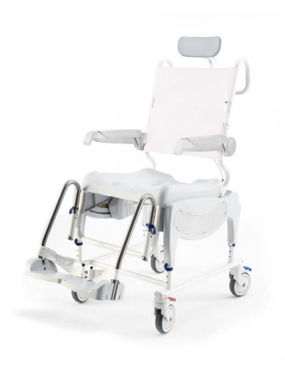
Ocean VIP Ergo

An entry level self-propelling model with a heavier maximum user weight