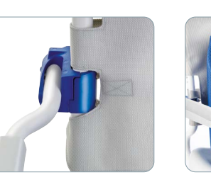
Wider XL armrests Increases the distance between the armrests by 40 mm on each side.

Increases the width between the armrests by 80 mm. Can be retrofitted to standard Ocean Ergo models.