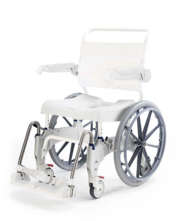
Ocean 24" Ergo XL

An entry level self-propelling model with a heavier maximum user weight