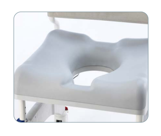
Redesigned to mirror

the contours of the new ergonomic seat plate, the softer feel gives users with Available in two versions sensory or skin protection for standard soft seat and issues added relief. Smaller small soft seat. Standard aperture also available for version fits also directly on shorter or thinner users. the seat plate. Easy to fit and clean.