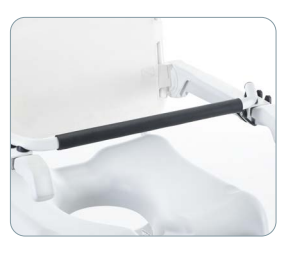
For additional safety and reassurance.