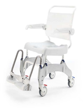
Ocean Ergo XL

An entry level attendant propelled model