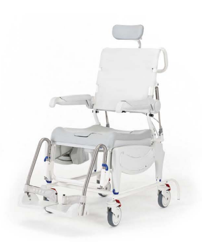
Ocean Dual VIP Ergo

A tilt-in-space model for additional seating and positioning support